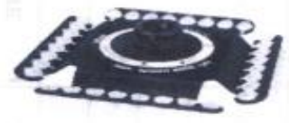
SR-32 BS-010205-FK rotor

Rotor for 4 x 8-section 0.2 ml microtube strips